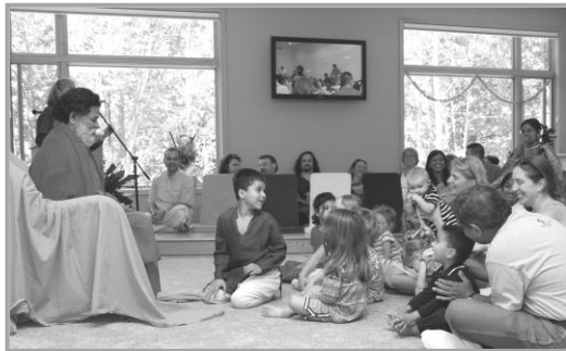
Children's Program at the SCHE Inauguration